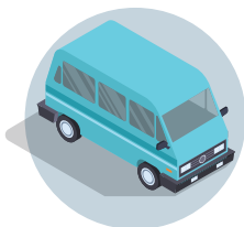
Informal ride-sharing and van pooling

Small scale, modular and easily replicable mobility services provided at affordable prices or with minimum subsidies