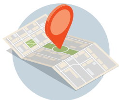
Community transport services