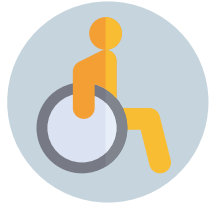
People with reduced mobility