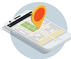
Innovative ride-hailing mobility services