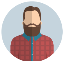
People living in rural and deprived areas