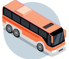
On demand flexible public transport

USER-ORIENTED APPROACH, not a technology push approach