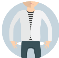
Low income and unemployed

Social groups and individuals as RESPONSIBLE PRODUCERS AND CO-USERS of mobility solutions