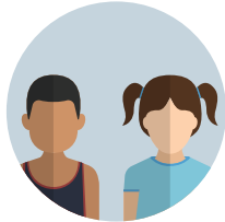
Children and youth

Addressing the needs of potentially vulnerable groups to favour INCLUSIVE MOBILITY